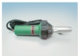
Hot Air Blower